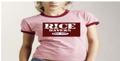
Girls Cap Sleeve